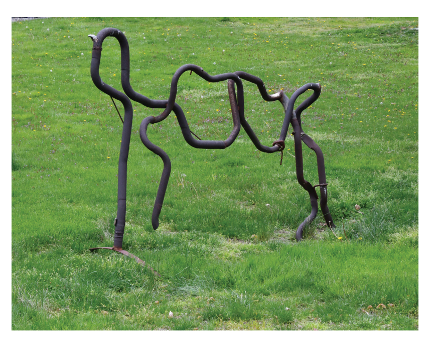
Jim Lloyd Large Domestic Animal Repurposed mufflers 7.5' x 5.5'