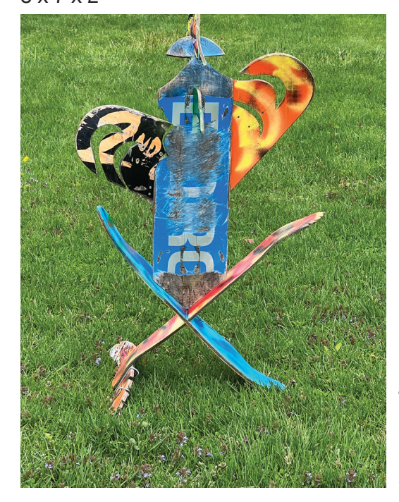
Betty Stafford The Traveler II Used and weathered skateboards. 45.5 x 24 x 29