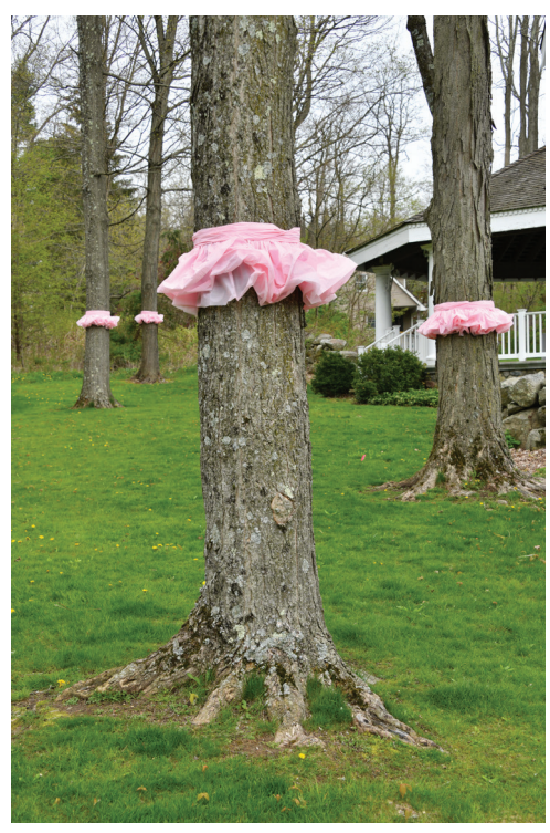
Elizabeth White Tree Skirts Plastic Dimensions variable