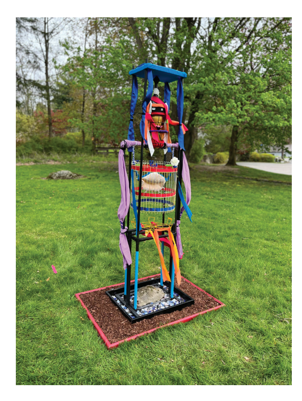
Inez Andrucyk Cosmic Heart 6.5 x 7' Mixed media