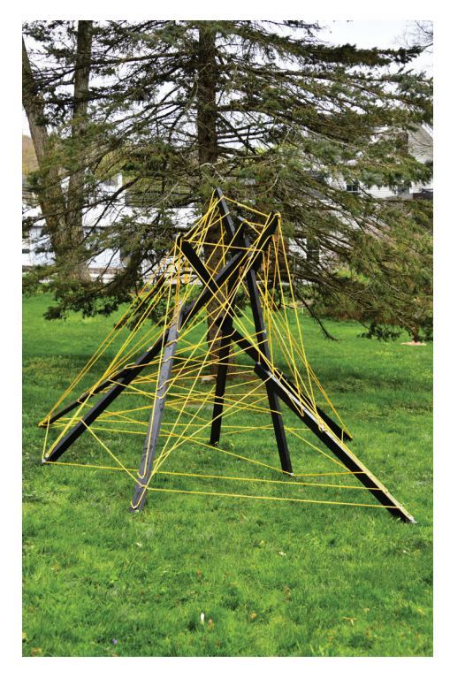
Kevin Laverty Summer House 2 8'x 9° x 8' wood, rope, screws, paint