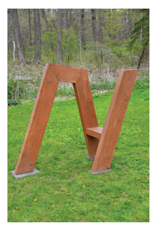
David Link Falcon Wood About 5 ft tall