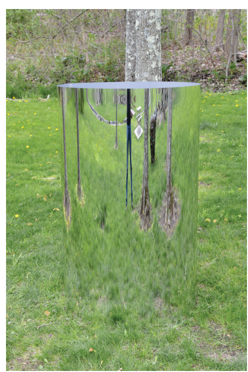
Marc Bernier DISTORDED VIEWS, 2020 48 x 86 x 12" Mirrored Plexiglas, Steel