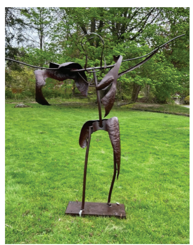
Chris Froehlich Come One! Come All! Steel 6.5 x 6 x 1 feet