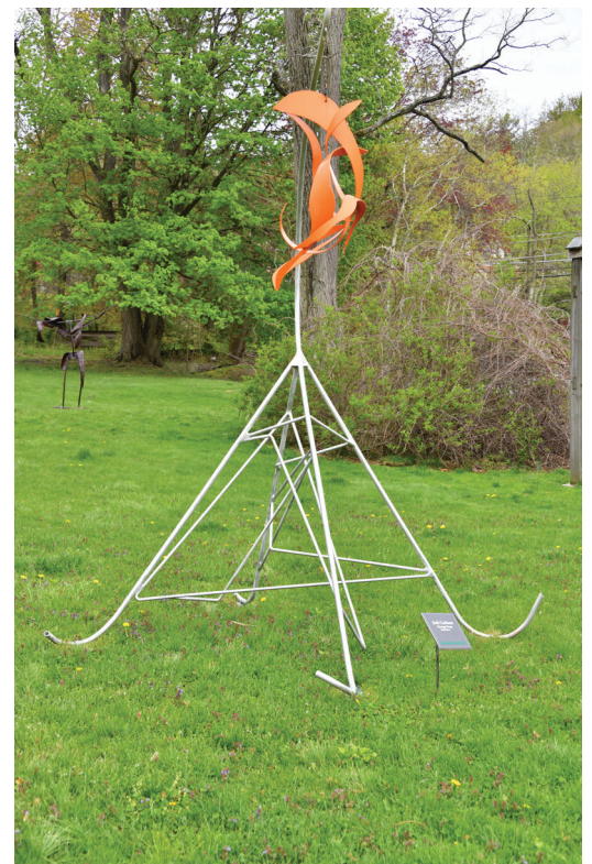
Jodi Carlson Orange Drop Aluminum 10 x 5' x 5'