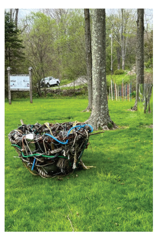
Fred Schlitzer The Bird's Nest 4 x2.5' Various mixed metals and materials