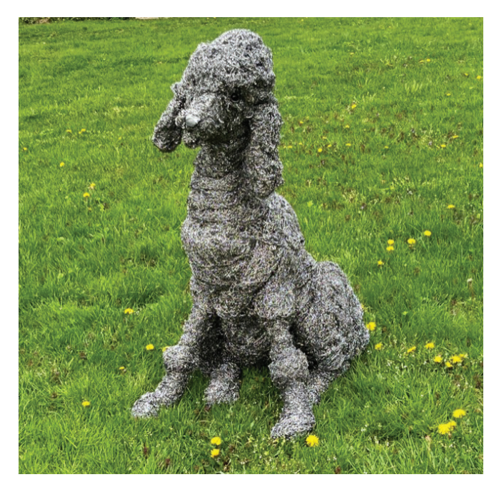
Hildy Potts Watchdog 1 4' x 2.5' x 3' Steel and steel wool