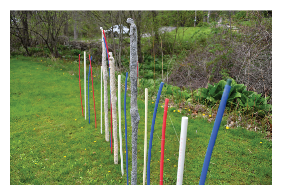
Jo-Ann Brody, My American Family Cement over PVC pipe, PVC pipe, rebar